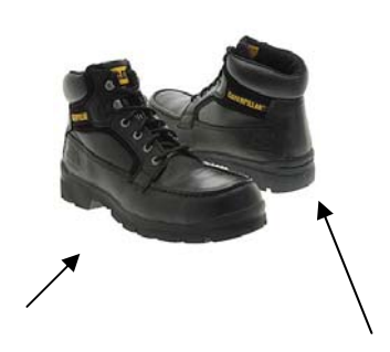
non-skid, work shoes with heel and rubber soles